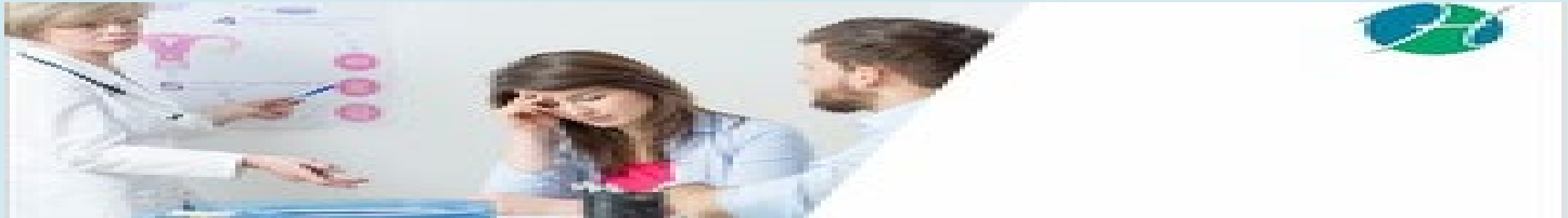
Sexually Transmitted Diseases (STD)