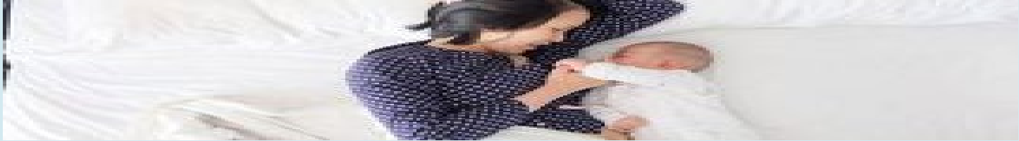
Fertility-Sparing Fibroid Treatments: Alternatives to Hysterectomy