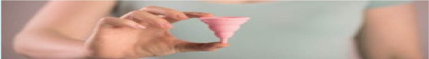
Surprising Reasons Why You Should Say Hello To Menstrual Cup