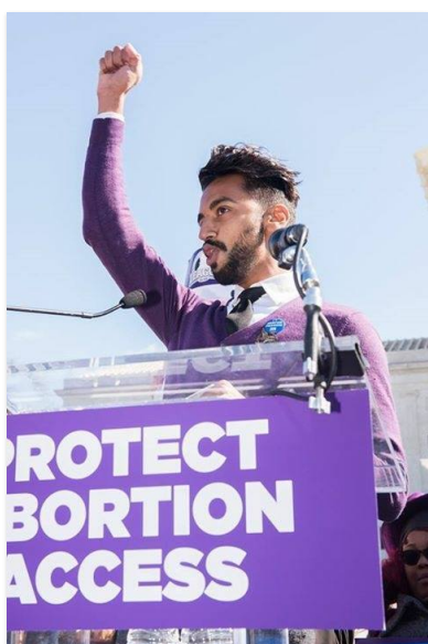
Dr. Kumar speaks at a rally on the steps of the U.S. Supreme Court in March 2016.

Posted on September 29, 2017 by prochoicetexas