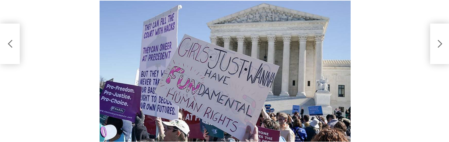
The Supreme Court should listen to the doctors who care for abortion patients

I am a family medicine physician and have been providing abortion in Texas for the past five years. I came back to Texas after my residency and fellowship to do this work because I was worried about what Texans who needed access to safe, legal abortion would do if there weren't doctors available to provide the care.