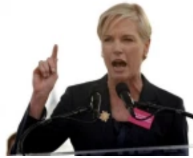
Cecile Richards; Planned Parenthood President

Planned Parenthood then took those hard earned dollars