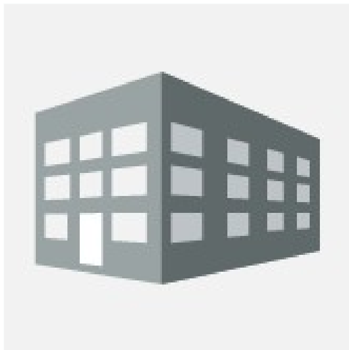
Kapiolani Medical Center At Pali Momi

☆☆☆☆☆ (/hospital/us-hi-aiea-kapiolani-medical-center-at-pali-momi/)