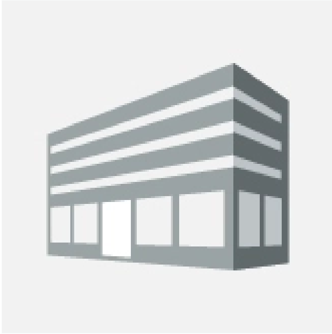
Concentra Urgent Care Golden Glades

★★★★★ (/urgent-care/us-fl-miami-concentra-urgent-care-golden-glades/)