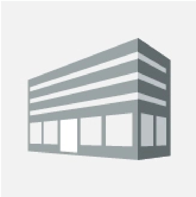
American Urgent Care, LLC

☆☆☆☆☆ (/urgent-care/us-fl-miami-lakes-baptist-medical-plaza-miami-lakes/)