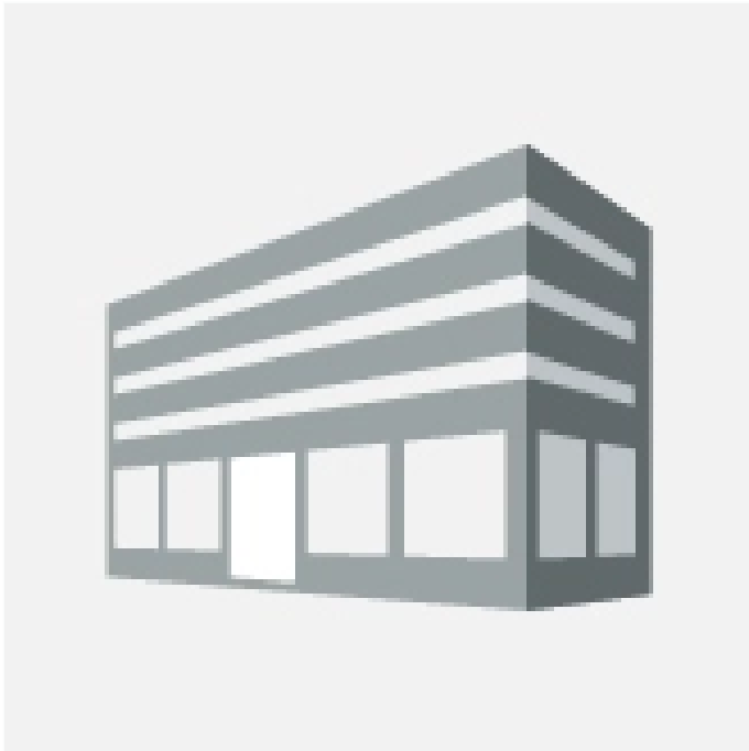
Urgent Care Clinic of Waikiki

★★★★★ (/urgent-care/us-hi-honolulu-urgent-care-clinic-of-waikiki-259/)