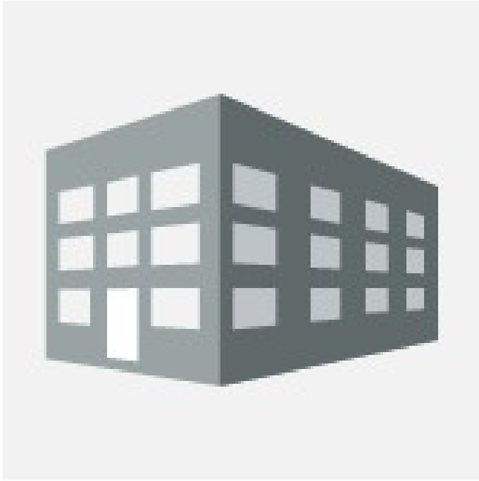
Kapiolani Medical Center For Women

★★★★★ (/hospital/us-hi-honolulu-kapiolani-medical-center-for-women/)