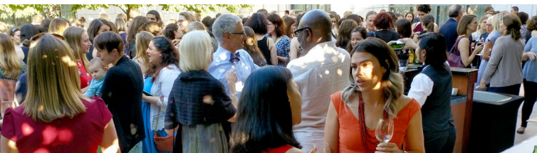
Fellowship in Family Planning grants (page 15)