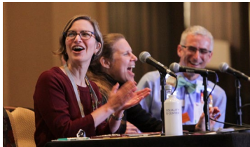
Clinical practice guidelines (page 4)