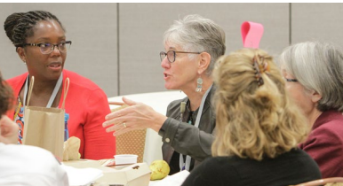
SFP membership (page 3)