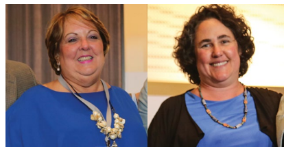
Annual meeting (page 18)