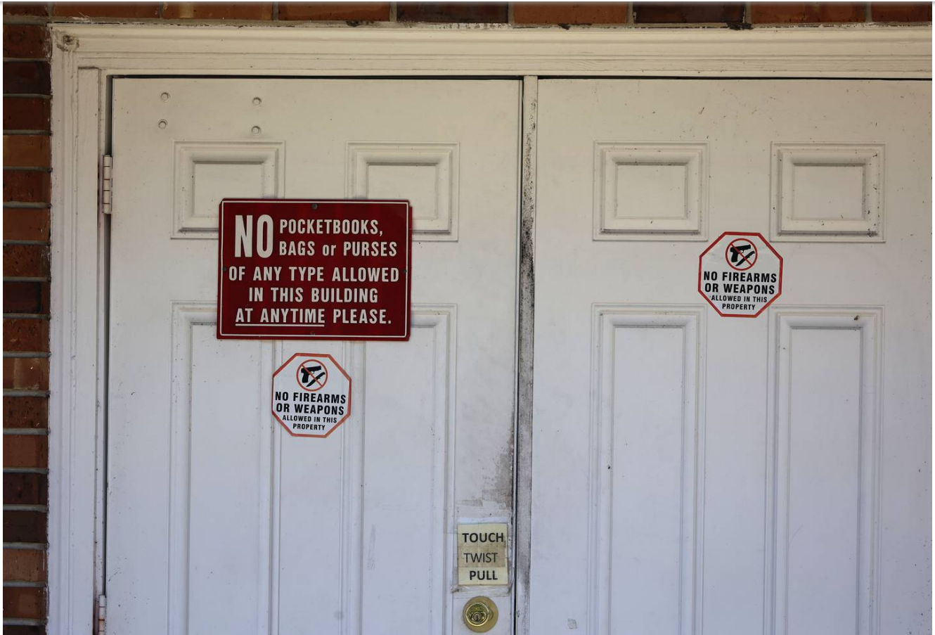
The Orlando Women's Center, on Monday, September 12, 2022.

According to 2021 Florida Agency for Health Care Administration data , the Center of Orlando for Women — which treats patients under the name of the Orlando Women’s Center — is one of two clinics in Orange County licensed to perform first- and second-trimester abortions and one of five in Central Florida.