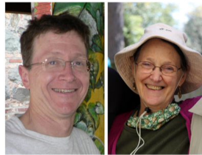
It's time for PSE to...