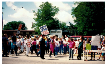
Hundreds of pro-life and pro-abortion people regularly came out to the Robbinsdale abortion facility in the early 1990s until numbers were limited by court order.